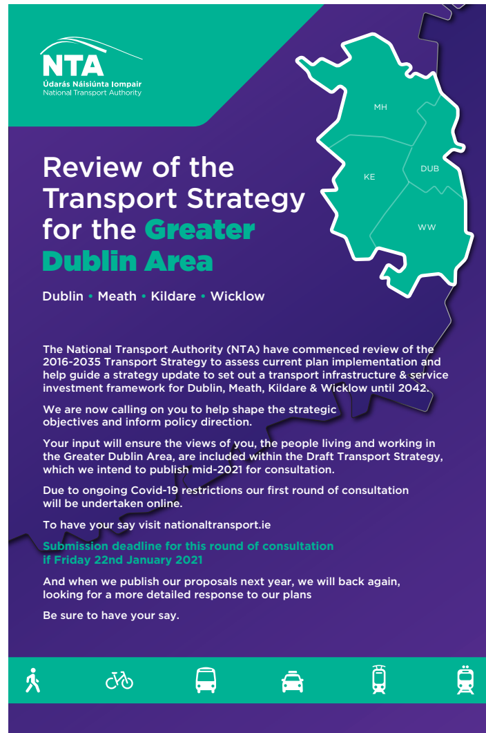
Figure 6.1: Outdoor Advertisement on Transport Strategy Review from November 2020

In total over 4,000 submissions were received, predominantly from the general public, with 92 submissions received from various stakeholders and groups. Almost half of respondents who gave a place of residence, were from County Meath, reflecting the scale of the campaign to deliver a rail service to Navan.